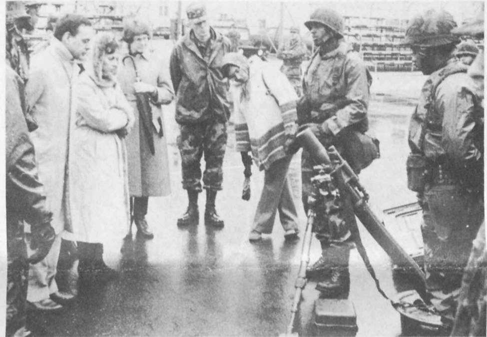
STATIC DISPLAY—Members of 2nd Battalion explain the 4.2 mortar to State Department guests last Thursday. The diplomatic guests toured the

battalion's guests enjoyed a meal in the Guardian Battalion's Dining Facility to conclude the day's events in a better understanding of the military and its capabilities in Berlin.