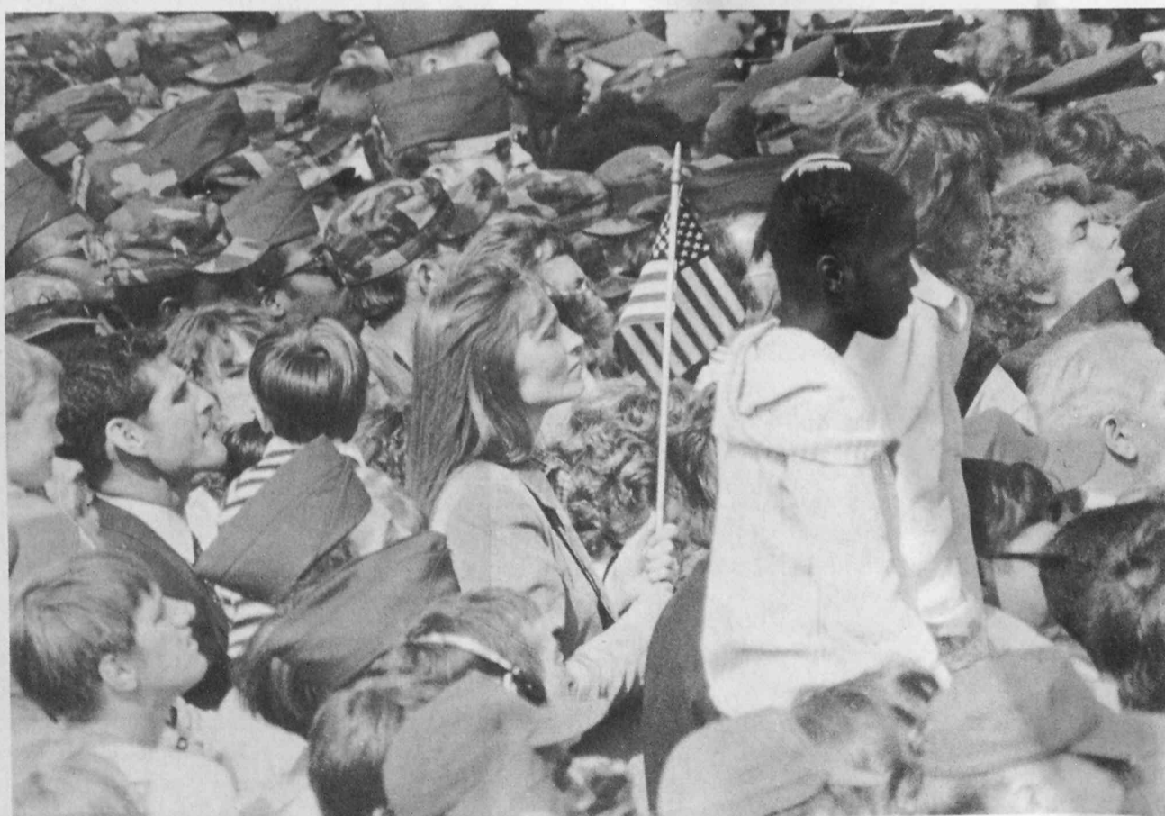
FLAG WAYER—One of the more than 3,000 people who attended the arrival of President Reagan

remembered to bring a flag. Flags were in evidence throughout the crowd.