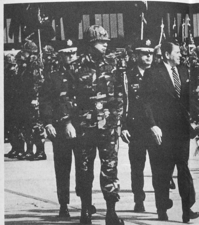
INSPECTION—Before speaking to the crowd at TCA, Reagan inspected the Troops. The Berlin Brigade, Air

He closed his speech with, "We all remember John Kennedy's stirring words when he visited Berlin. I can only add that we in America and the west are still Berliners, too. And always will be. And I am proud to say today that it is good to be home again."