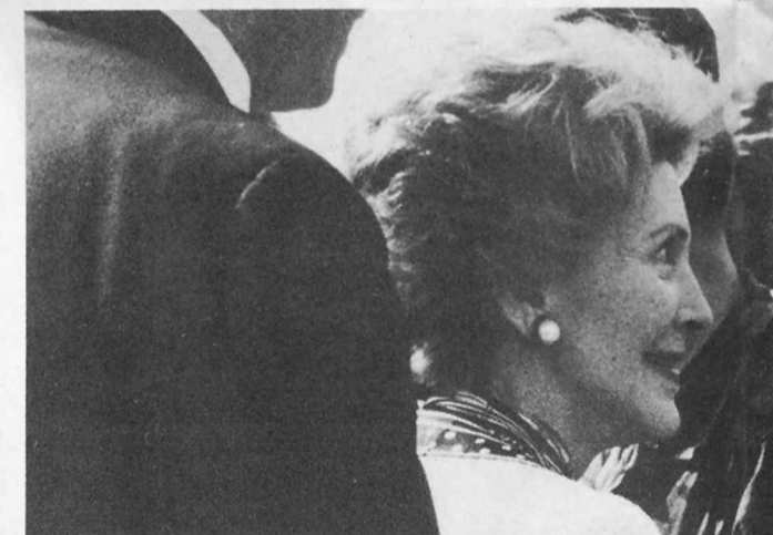
FIRST LADY—Nancy Reagan stops to talk with American family members at Templehof Central Air-