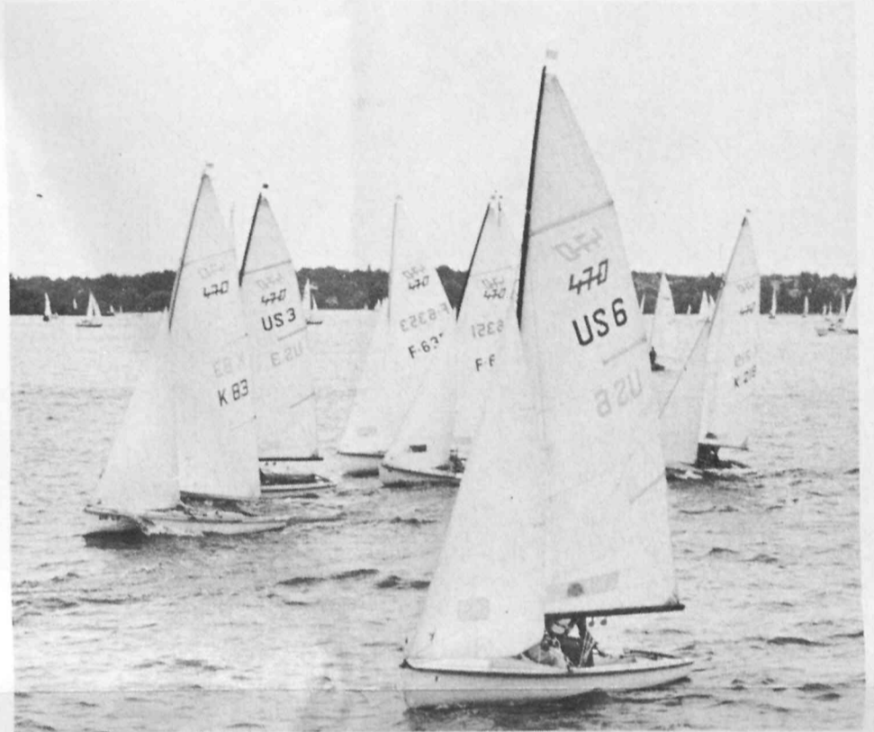
SHEETS IN THE WIND -The 470s get under way in last weekend's Annual American Regatta held at the Wannsee Recreation Center. A British sailor