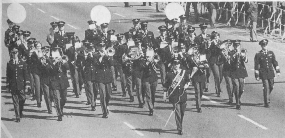
SEVENTY-SIX TROMBONES—The Berlin Brigade Band leads the way for American foot elements. The 1st and