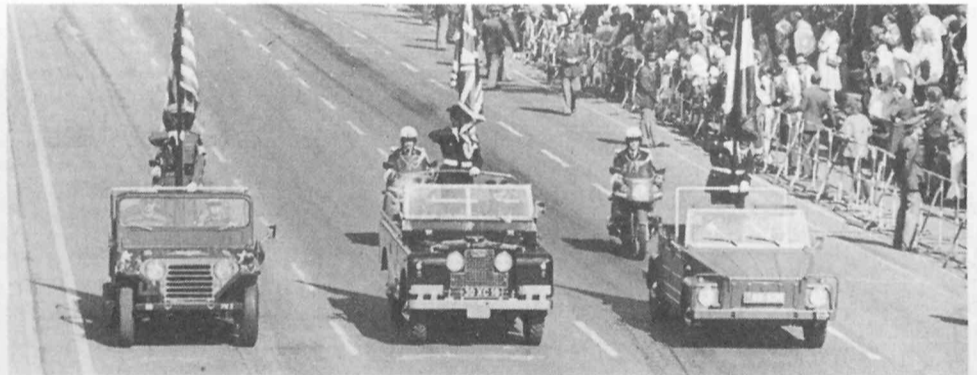
PRESENTING THE COLORS —A color bearer from each of the Allied Forces presents the colors of his

team, including the U.S. 509th Airborne Battalion Parachute Team from Vicenza, Italy.