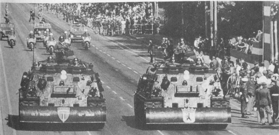
UNUSUAL DISPLAY—The M88A1 Tracked Recovery Vehicles from Company F, 40th Armor lead the way for