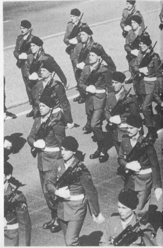
READY —French soldiers from the 46th Infantry Regiment march down Strasse des 17. Juni with their weapons at the