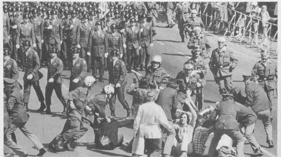
SIT-IN —More than 60,000 people, including a few demonstrators, turned out to watch this year's parade. The demonstrators' sit-in on Strasse des 17.

Juni didn't stop 2nd Battalion soldiers. They made a quick assessment of the situation and guided around the minor disturbance.