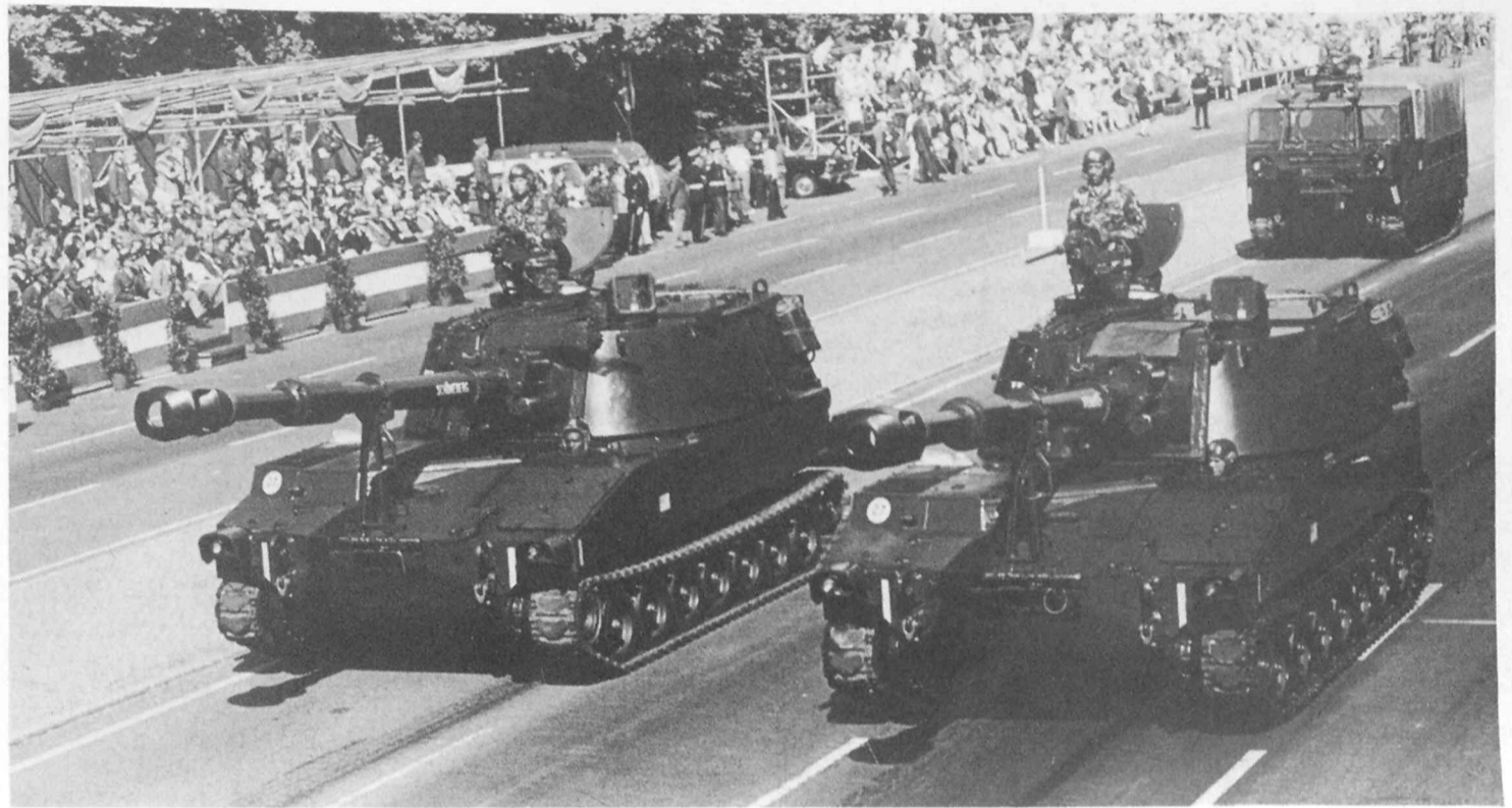
ROLLING ALONG—Howitzers from Battery C, 94th Field Artillery, Combat Support Battalion, roll past the