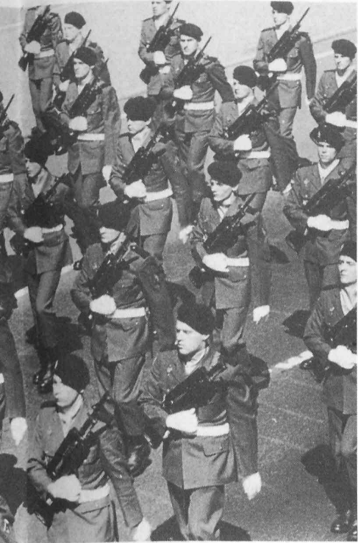
ready position. More than 750 French soldiers took part in this year's parade.