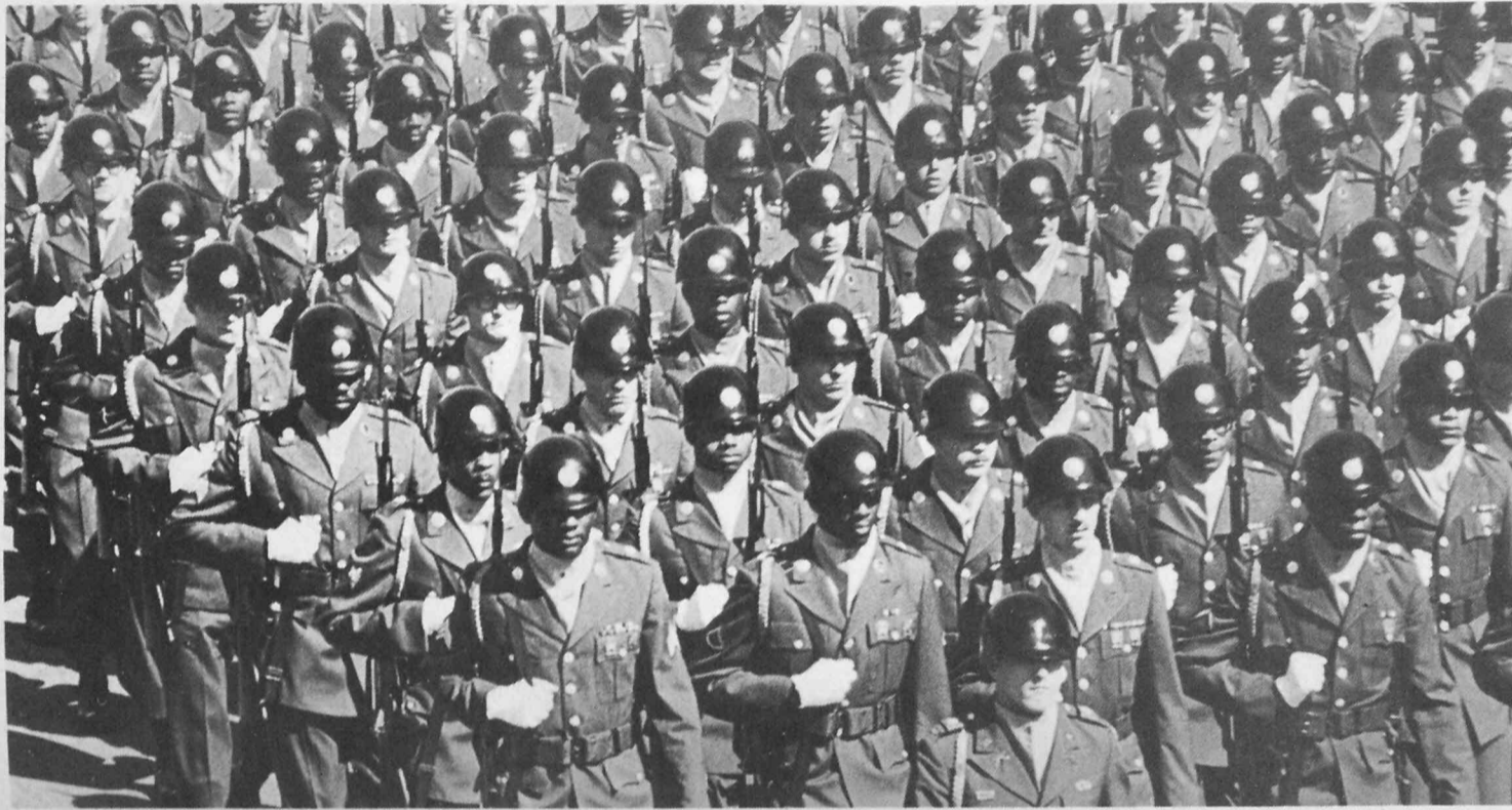
ROWS AND ROWS —Members of the 4th Battalion, along with hundreds of other American and Allied soldiers

More than 60,000 people watch colorful display by American, French and British troops