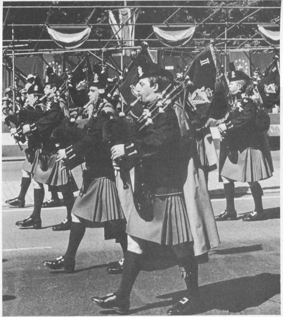
BLOWING THE PIPES—Bagpipers of the 2nd Battalion, Royal Irish Rangers Band pass the reviewing