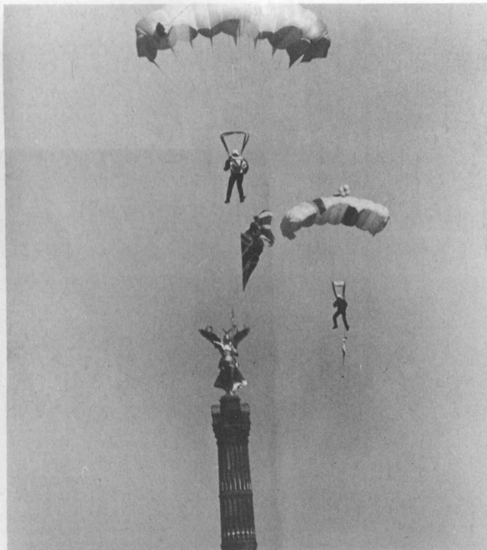
ONCE AROUND THE COLUMN —Precision landings were performed by members of the Allied parachute

team, including the U.S. 509th Airborne Battalion Parachute Team from Vicenza, Italy.