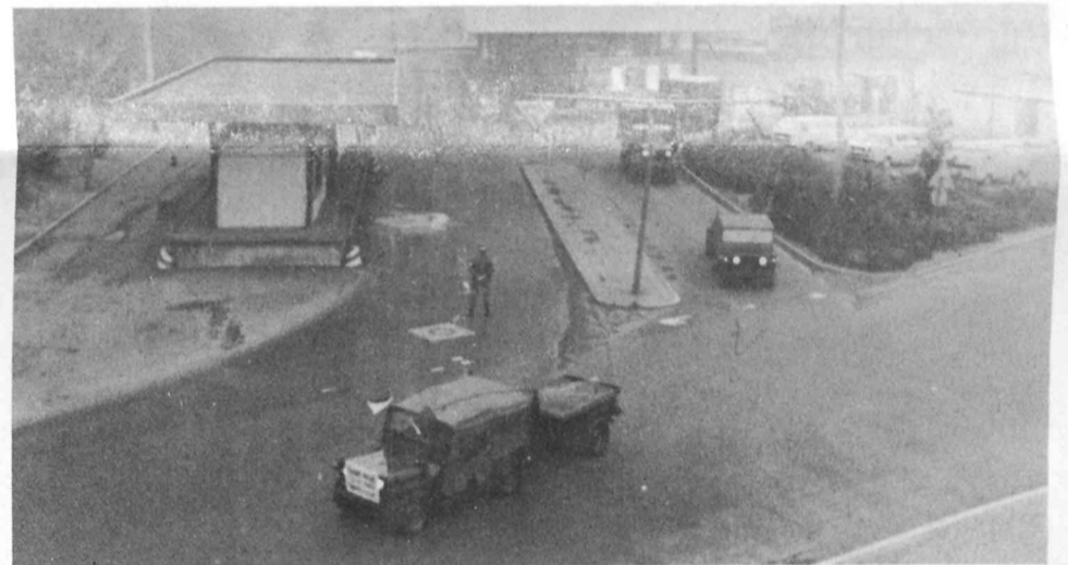
ROLLIN', ROLLIN'—Trucks from Combat Support Battalion moved out Tuesday morning for a training exer-

The members of the Combat Support Battalion will be in the field for some time, but the training they will experience will make the entire exercise a worthwhile one.