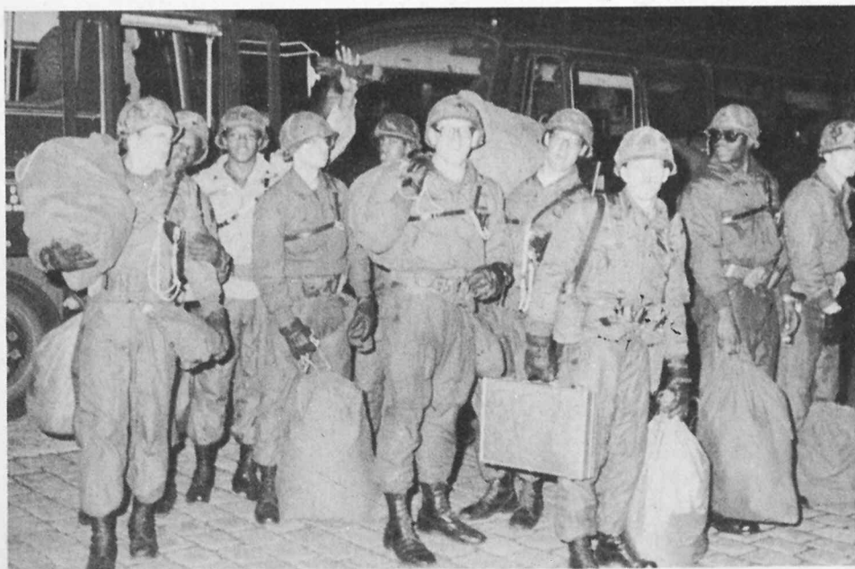
SO LONG, GOOD BYE—It's off to Grafenwoehr for these soldiers from the Combat Support Battalion who

cise in Grafenwoehr, West Germany. The vehicles moved out from Checkpoint Bravo.