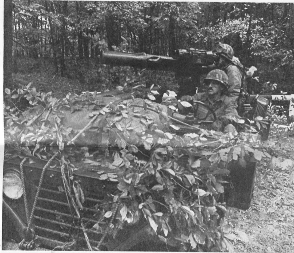
TANK KILLER — As blue forces withdraw, a friendly TOW gunner sets up a subsequent fire position to engage advancing red force armored vehicles. The 4th Battalion provided

mobile and lethal support with infantry, ready to fight back as soon as the opportunity came up. And they did, very effectively.