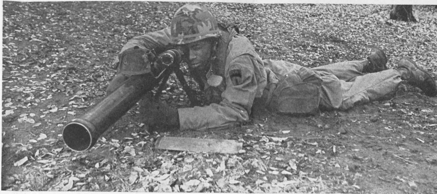
ON LINE — A member of 4th Battalion lays out fields of fire with his 90MM recoilless rifle. He is prepared

Like the Dakota, an alliance made stronger in the face of danger, the FTX represented the solidarity of the U.S., British, and French Allies in West Berlin.