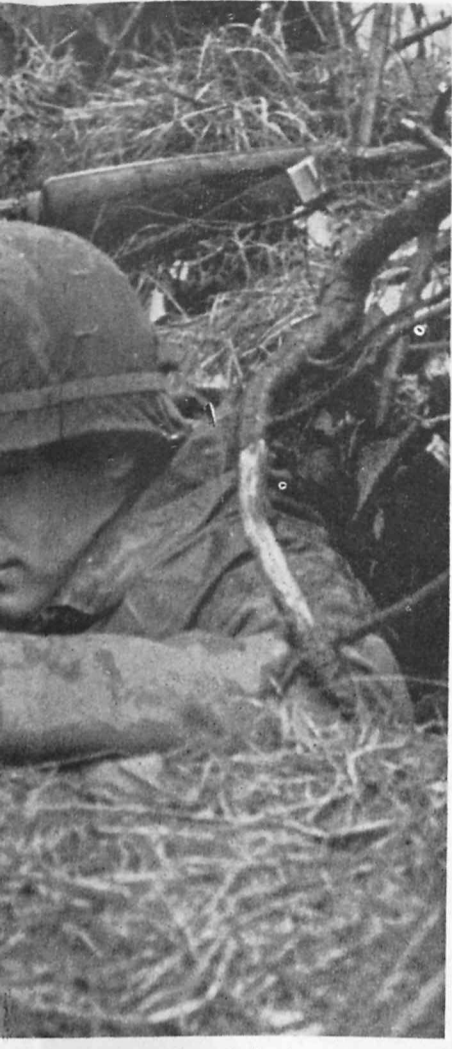
team were on hand during the Allied Field Training Exercise, performing guard duties around the perimeter.