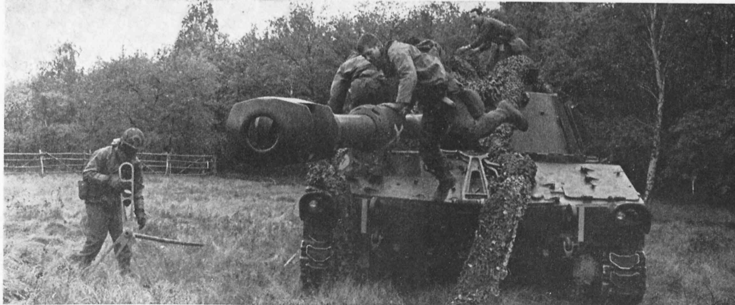
HUSTLE TO COVER — Members of Battery C, 94th Field Artillery, Combat Support Battalion, arrive at a de-

fensive position and rush to camouflage their Howitzer. C, 94th, the only artillery unit in the western sector of