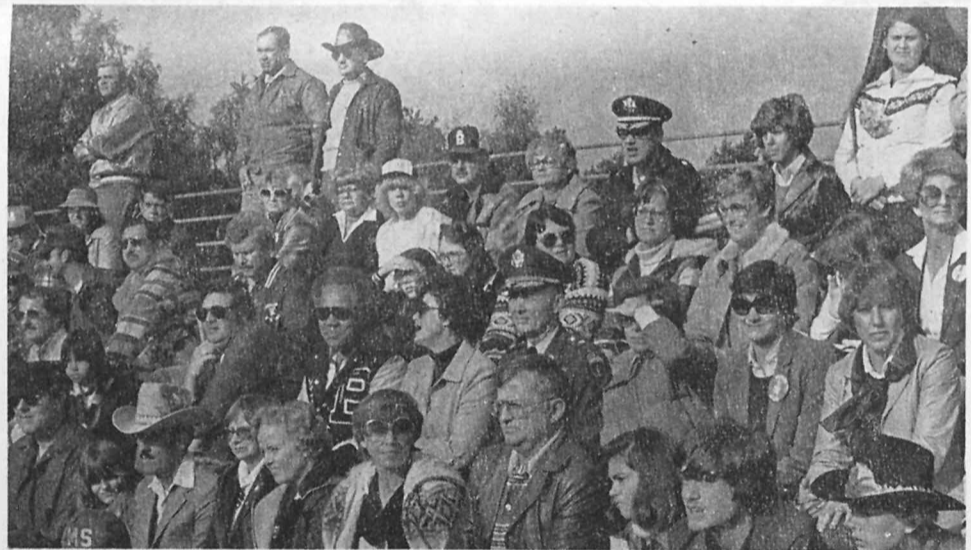
WATCHING THE ACTION — A crowd of more than 500 spectators was on hand Saturday as the Berlin