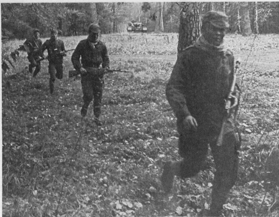
ON THE ADVANCE — A French Gendarme fire team closes on the objective with the support of a French

The objectives of the FTX were many. It was developed to promote allied cooperation and understanding, provide training to allied soldiers in Military Operations in Urban Terrain and conventional operations, improve allied logistical support, tactical communications procedures, medical sup-