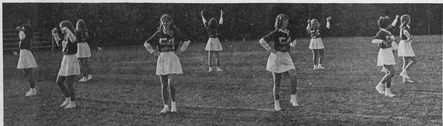
GO TEAM GO — Members of the Berlin American High School Drill