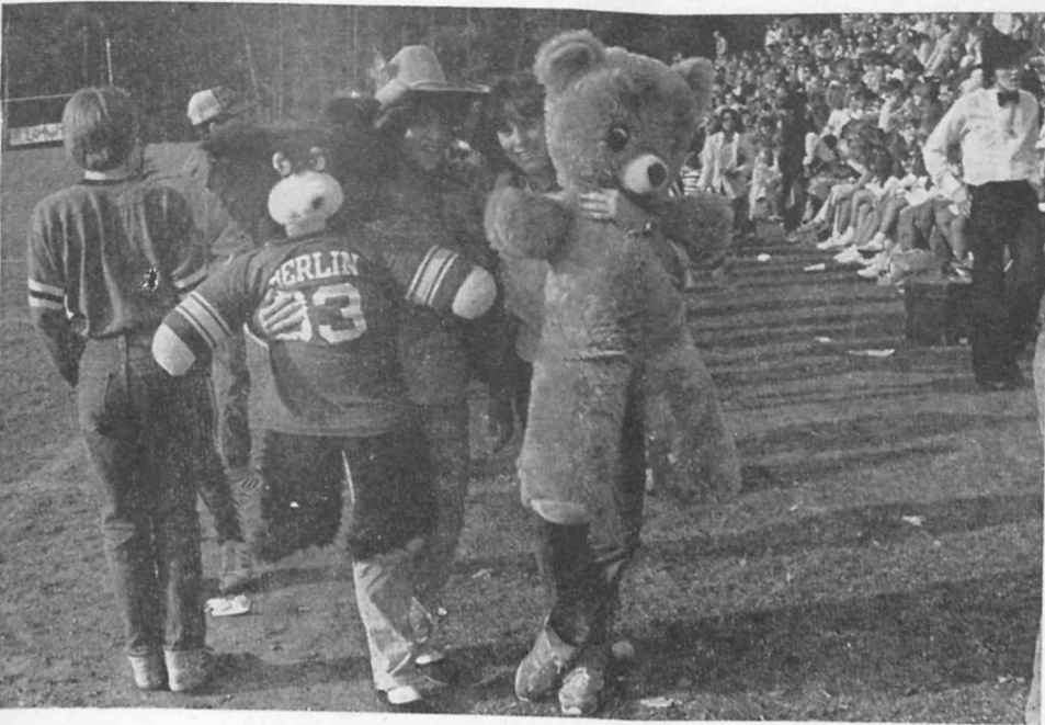
ROOTIN' FOR VICTORY —Two Berlin American High School girls hold their Berlin Bears during Saturday's