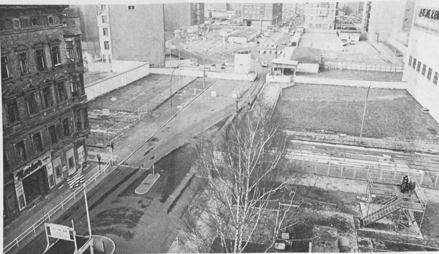
VIEW FROM THE TOP — Checkpoint "Charlie" is the only Allied checkpoint for entry into East Berlin. All travelers, military and U. S.

Government employees and their family members must process through the checkpoint, (U. S. checkpoint at lower left of photo), upon