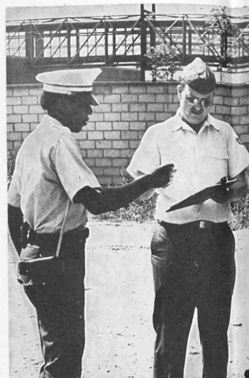
"JUST SIGN ON THE DOTTED LINE" — Immediately after returning from East Berlin, a traveler's vehicle is processed. After the military