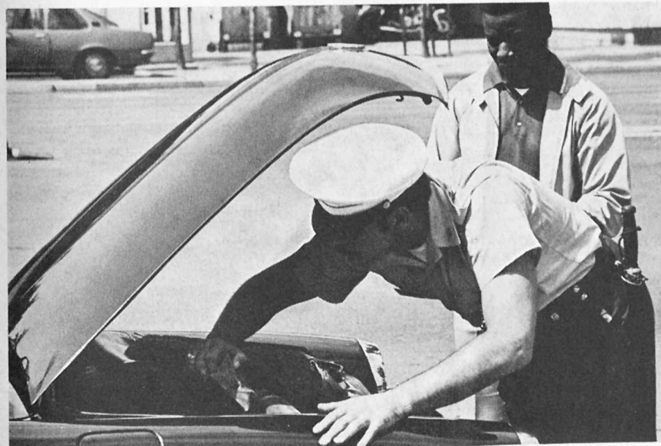
WITH BEST INTENTIONS IN MIND — A Military Police member will conduct a safety inspection of your vehicle before you begin a trip along the Berlin-Helmstedt Auto-

You must not engage in any activity or conduct embarrassing to the U. S. Government.