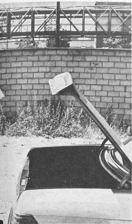
After a military policeman has performed his duties, travelers will be asked to complete and sign a form used to document your travel in East Berlin.