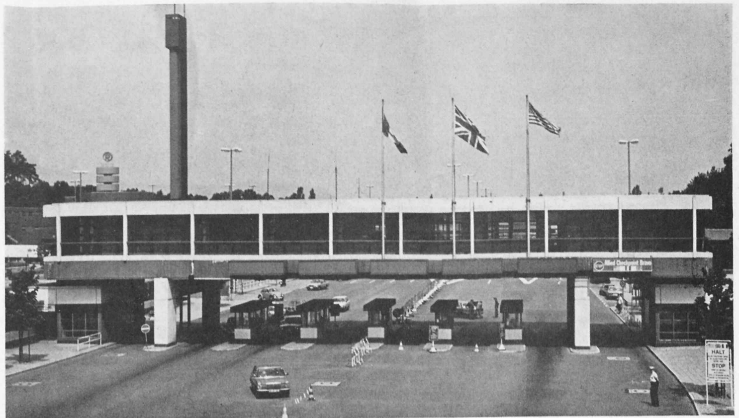
WELCOME HOME — Travelers driving from Berlin to Helmstedt on the autobahn must process through Allied Checkpoint "Bravo." At the checkpoint, travelers receive a safety

inspection, a briefing, and a check to ensure that their documents are correct. Travelers returning to Berlin should make sure that they don't go through the toll booths, but to the