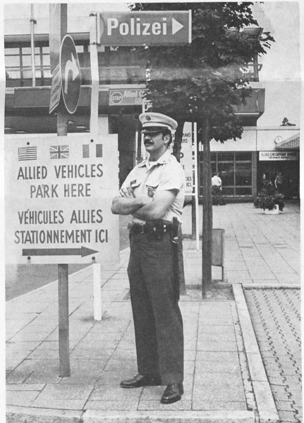
WAITING PATIENTLY — As soon as a traveler ends his trip on the Berlin-Helmstedt Autobahn, a military policeman will be waiting in the

parking lot to process your vehicle. By following the checkpoint MP's instructions, your trip will be quicker and smoother.