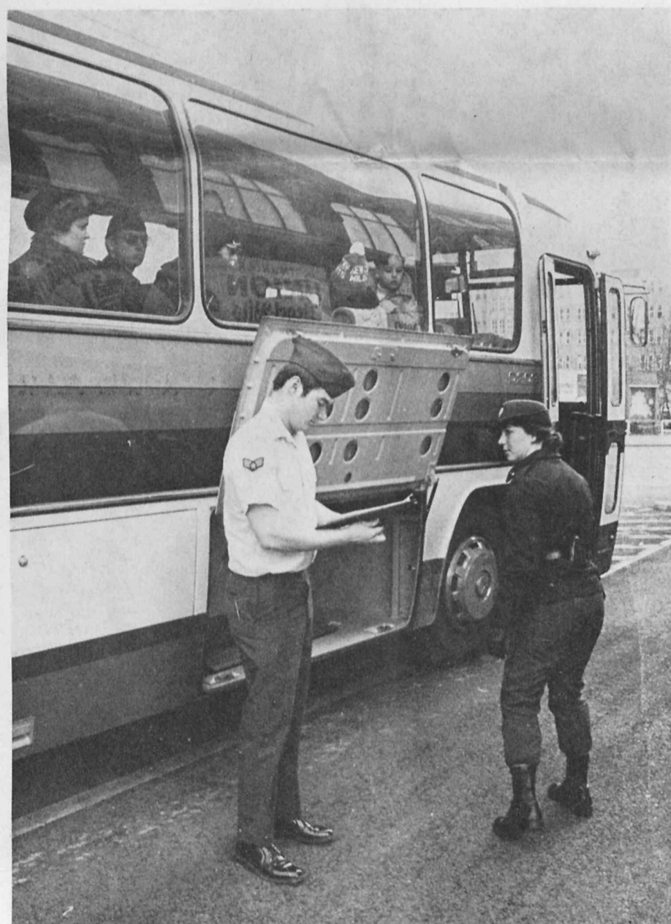
"EVERYTHING'S OKAY!" — All vehicles, including tour buses, will be processed upon return from East Berlin. Military Police personnel will

direct drivers into the proper parking areas. Drivers must exit the vehicle and assist the MP's as requested.