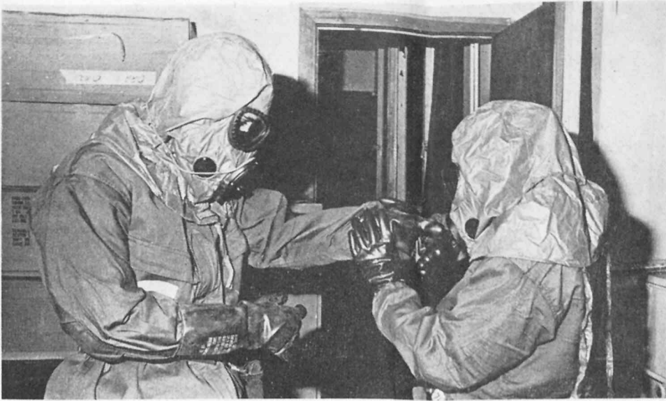
A HELPING HAND — One Personnel Administration Center soldier from Combat Support Battalion helps another during their Mission Oriented

Protective Posture exercise. Proper wear of the chemical protective suit was one task the soldiers were "tested" on