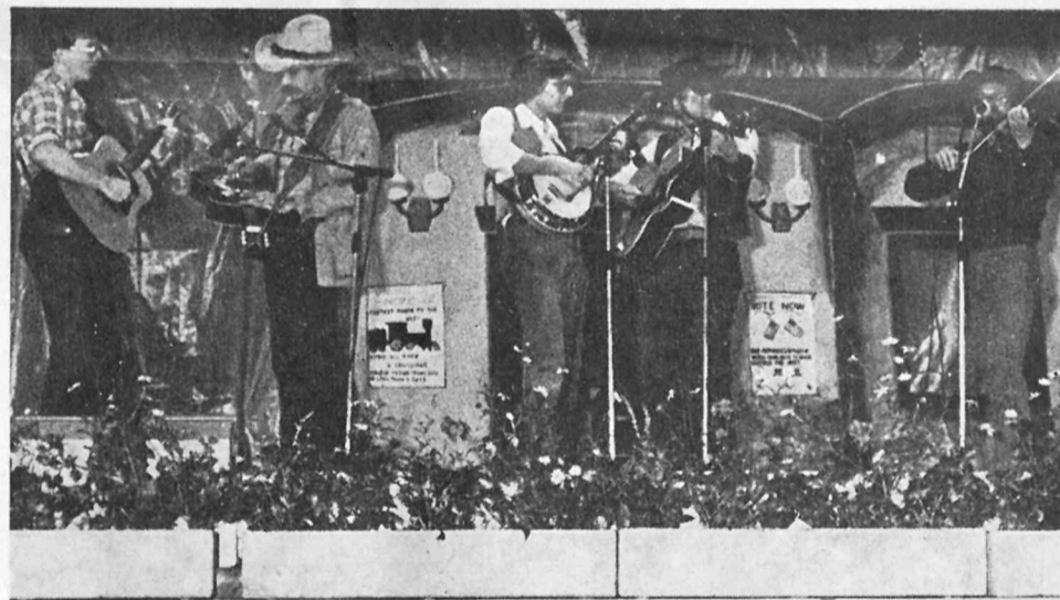
AND THE BAND PLAYED ON — Bands and many other forms of entertainment can be seen at the 1981 German-American Volksfest which

Whether it's for the food, music, rides or just to mix with the different cultures, this year's Volksfest has something for you so come on out ... it's guaranteed you'll have a good time.