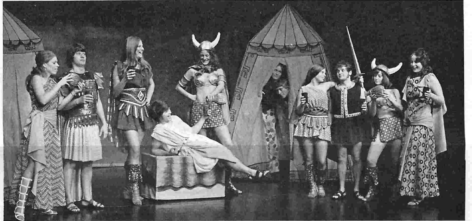
USO Shows, in affiliation with the American Theatre Association, will present "By Jupiter," a rousing musical comedy set in the pre-Christian era. The story concerns Amazons and Greeks and their fight for the powerful sacred girdle of Diana. Mistakes, chases and pretty girls all combine in song, dance and laughter to tell the story of the battle of the sexes.

Berlin's AUSA has been re-vitalized, as evidenced by the successful business and social functions it hosted this past weekend. Can you identify any major areas where the Army needs improvement? Your suggestions, coupled with those of other AUSA members, can be molded into resolutions which can change this organization. Find out for yourself by contacting your nearest AUSA representative.