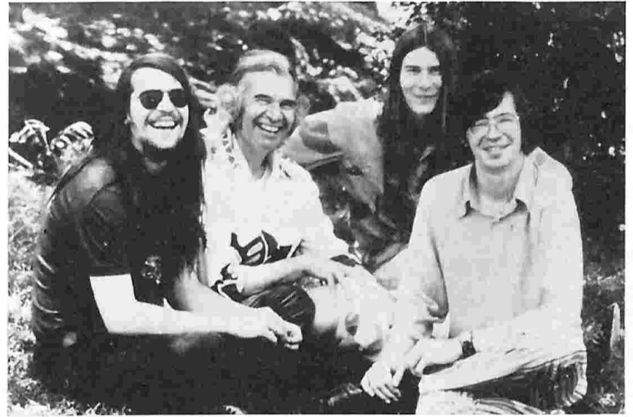
DAVE BRUBECK AND FAMILY

Needless to say, you'll have to search pretty hard in order to find a travel agency which has such information, from the horse's mouth so to say, available. The information you can get here isn't limited to those promising travel folders. You can also talk to the representatives of the many lands or sit down for a couple of hours in the "Travel Cinema" at the exchange, where films are shown. With a bit of imagination, you can have that trip around the world for the mere admission fee to the exhibition. Bon Voyage!