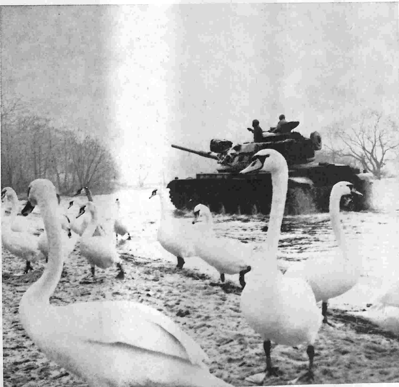
THE TANKS OF 40th ARMOR take the beach, scattering a group of slightly perturbed swans. The tanks were ferried across the Wannsee by the British Pioneer Boat Platoon, 1st Battalion of The Parachute Regiment.