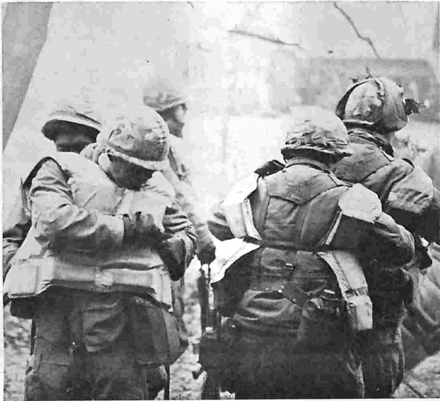
AS THE EARLY MORNING MIST rises from the water, men of 2nd Battalion, 6th Infantry strap on their life vests in preparation for the coming beach assault.