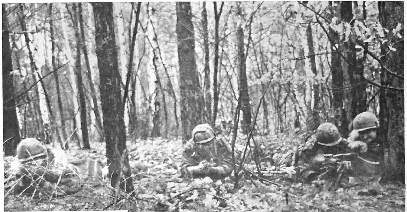
MEMBERS OF THE BRITISH aggressor force (Below) stand ready to meet the tank attack expected at their front. The tanks never showed though and the British were taken by surprise from the rear by Co B, 2-6.