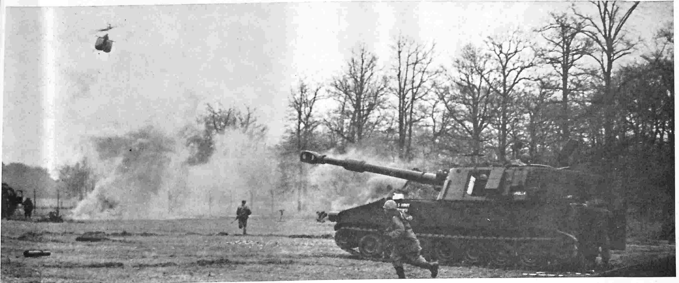
A SNEAK ATTACK by a squad size force of the 1st Bn. The British Parachute Regiment landed in the midst of C Btry, 94th Arty at Kearns Range. The British knocked out several of the howitzers during their attack only to find out later that, according to the FTX controllers, the helicopters had been knocked out of the air by a Red Eye Missile team before they ever landed.