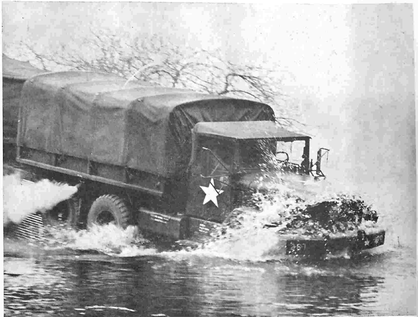
THE FIRST TRUCK hits the water to take "blue beach" as the first day of Operation Handshake gets under way.

C Battery, 94th Artillery; 1st Platoon, Company F., 40th Armor; and the Immediate Reaction Force Platoon of 4th Battalion, 6th Infantry supplied support for the two day exercise.