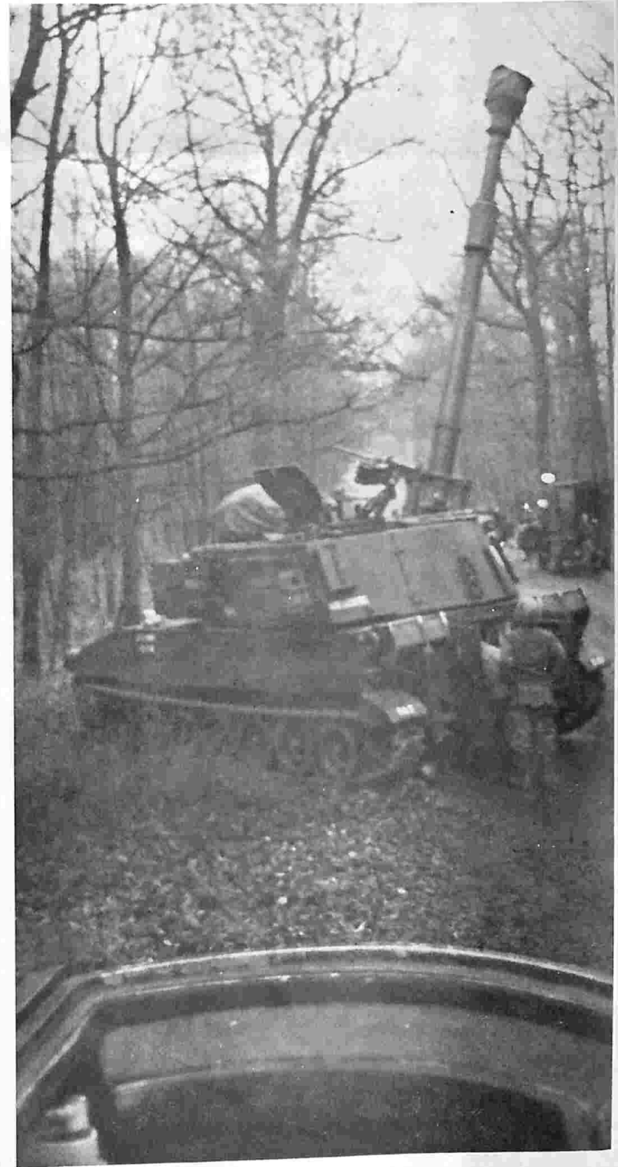
A HIP SHOT was called while a detachment of C Battery, 94th Artillery was on the way to join the rest of their unit at Kearns Range. During a hip shot the men must set up their guns on certain coordinates and get a round on the way as quickly as possible. One of the members of C Btry, 94th Arty said his gun crew could do it inside of two minutes.