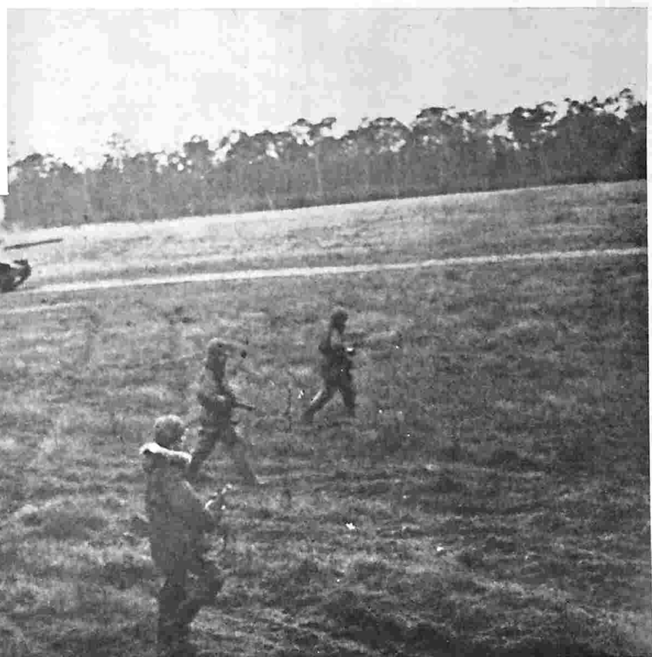
Co A 2-6 MOVES OUT (right) from the tankers to take one of their objectives. The force met heavy resistance and was showered with simulated artillery rounds and gas.