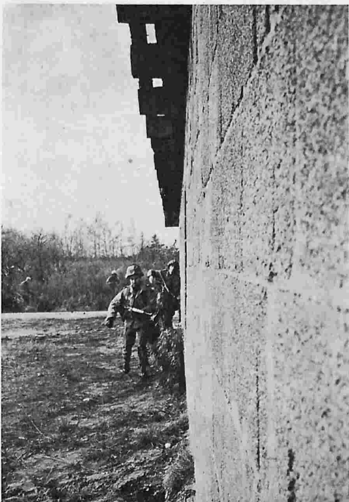
THE INITIAL ASSAULT on the CIC range is made from the field adjacent to the area. From the cover of the vegetation, the invaders can approach the range relatively unseen.