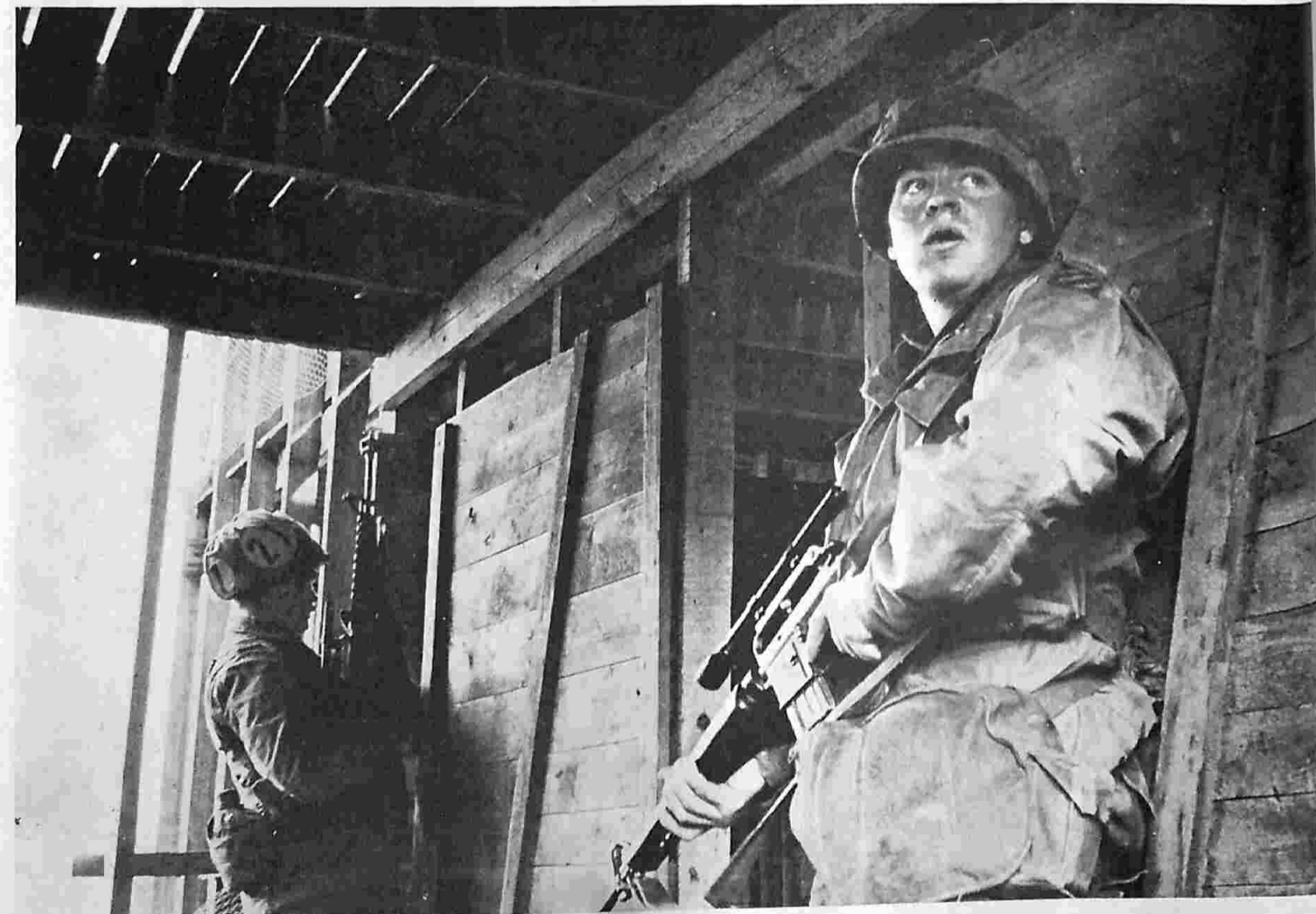
GO AHEAD, I'M RIGHT BEHIND YOU. Probably the most difficult aspect of the training received at the CIC range is learning to clear buildings of enemy troops and snipers.