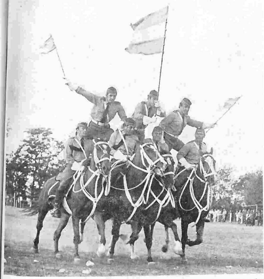
A SPECIAL SQUAD of the Argentine police force achieves on horseback what the Berlin police perform on their motorcycles. But that is not all the "Escuadra Azul" (Blue Squadron) shows at their daily appearance at the big International Horse Show on at the Deutschlandhalle until Tuesday.

I daresay this is quite a list of good reasons to make yourself an exciting afternoon or evening in the Deutschlandhalle at the horse show. You'll probably never again get a chance to see some of the things offered. The PX ticket agency has the schedule for the various events and will be glad to obtain tickets for you. A hint for the thrifty-minded: admission fees for this afternoon are very low (DM 3-10). You see a jumping competition and the "Escuadra Azul." If anyone is looking for me between today and next Tuesday, they'll have to come to the Deutschlandhalle!