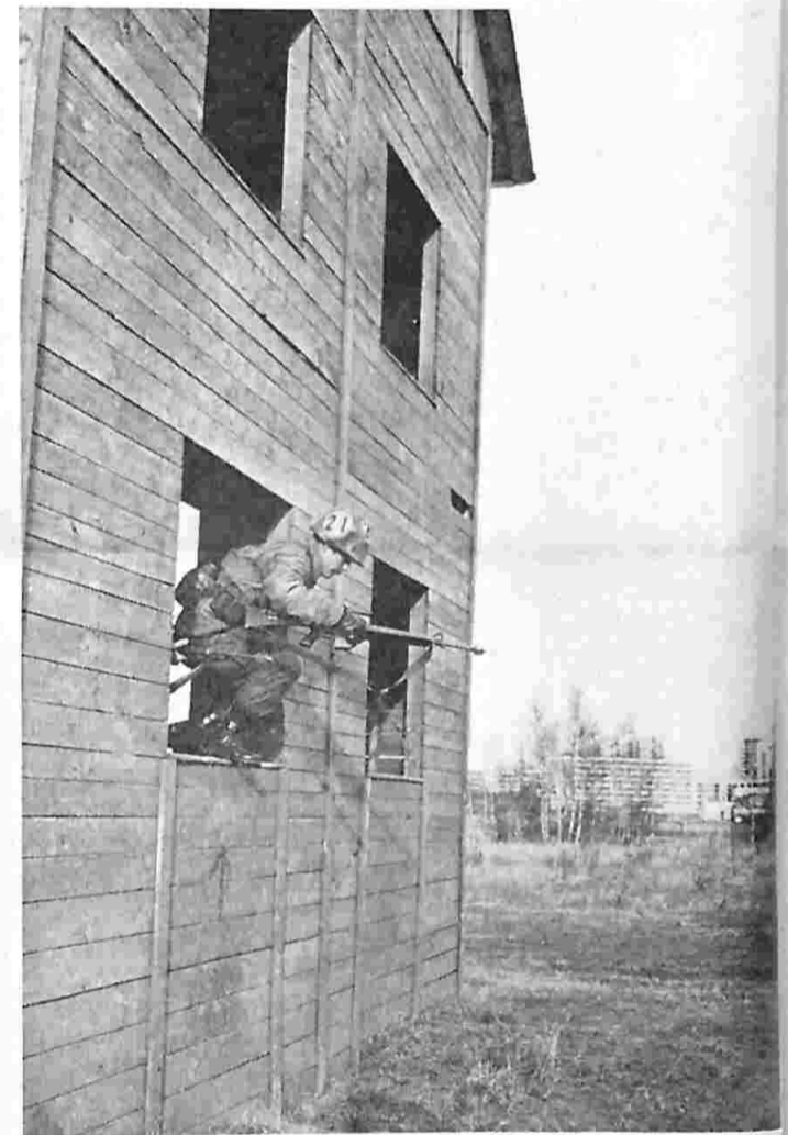
UNORTHODOX EXITS and entrances are part of the clearing of a city. You come in and go out where the enemy least expects it.