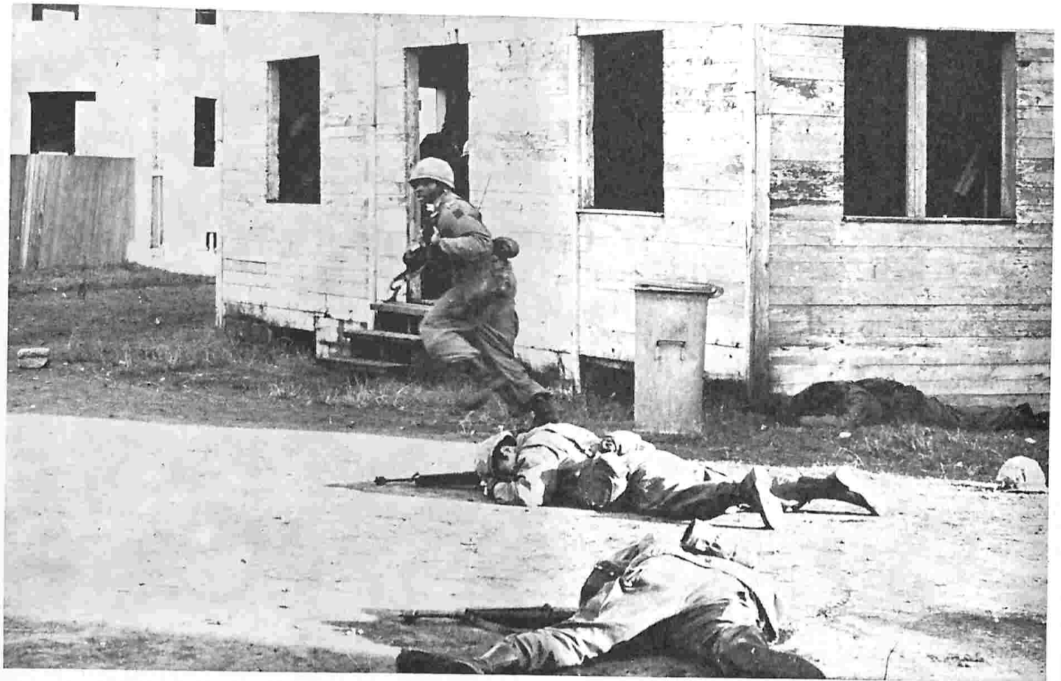
LYING DOWN ON THE JOB to provide realism. If a man's number (located on his helmet liner) is called out, he's declared "dead" by the umpires and has to lie down where he was "hit". It seems to make individuals a little more careful when they come to an area where their buddies are "down."