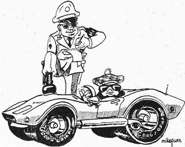
LET'S SEE NOW, 90 k's in a 50 zone, running a redlight, no turn signals, and NO SEATBELTS TO BOOT. You're in trouble, lady.

SSG Maroney put a lot of the blame for missed EERs on the raters. He stated, "I can't stress enough the responsibility of the rater. I mean if they don't do it, what good is it?" You!