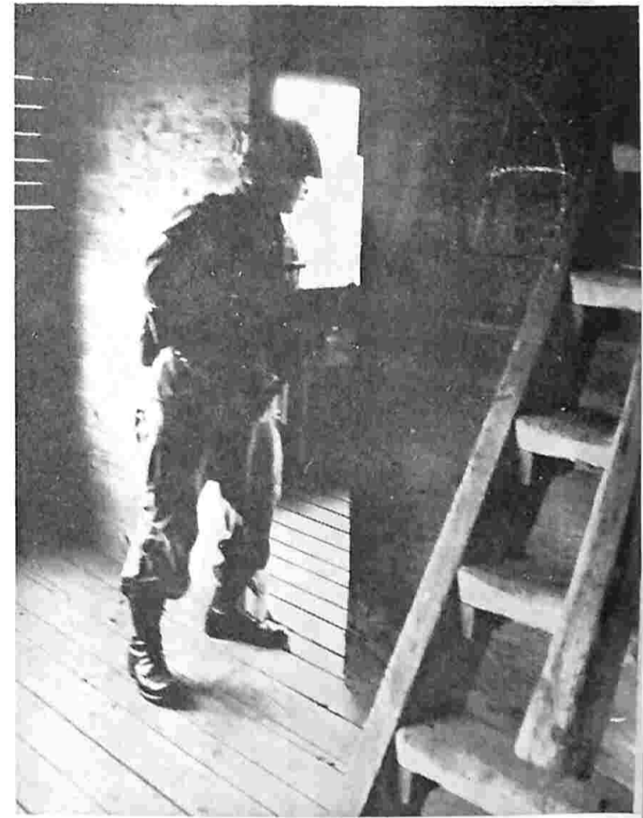
COME OUT, COME OUT WHEREVER YOU ARE. Clearing the bad guys out of a building is rough work. You never know when a rifle barrel will pop up from around a corner.

The city within a city provides the unique opportunity for soldiers from West Germany and Berlin to train effectively in city combat techniques.