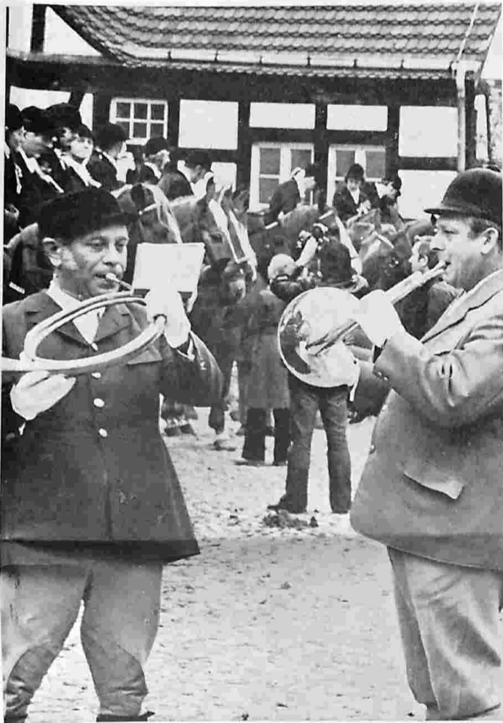
THE HORNS sound calling the riders to prepare to start the hunt.