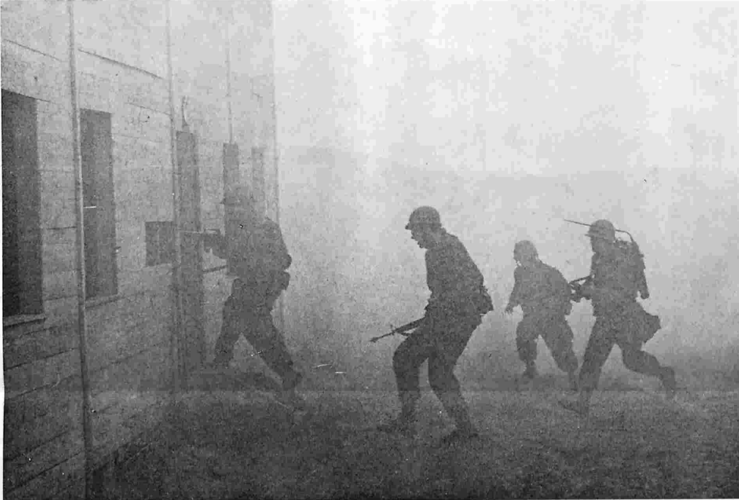
IS PICCADILLY CIRCUS AROUND HERE? Smoke generators provide some of the realism that makes training at the CIC range effective. The generators create an atmosphere similar to London on a bad day.