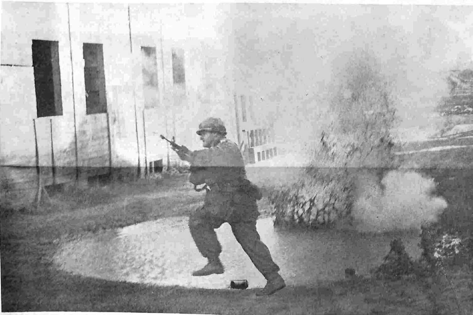
A NEAR MISS. To make a more realistic combat scene, smoke grenades and simulators are used throughout the city.