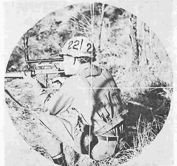
GOTCHA! A trooper, as seen through the scope, is marked for the kill during SCOPES training of the 1st Battalion, 508th Infantry, 82nd Airborne Division at Fort Bragg, N. C.

The SCOPES System is available for loan on a first-come, first-served basis from the Berlin Brigade G3 Training Aids Center. Commanders interested in using SCOPES for training should contact the G3 Training Aids Center, McNair Barracks, in sufficient time to insure availability.