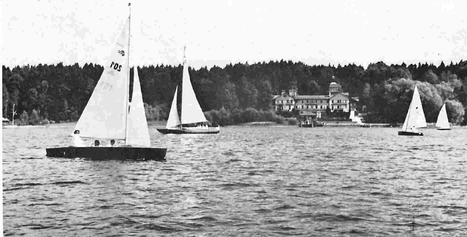
SAILING — The 10th annual AFRC "Learn to Sail" program will get underway at the Chiemsee Recreation Area