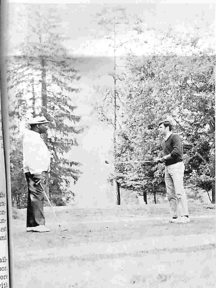
PROPER SWING — This is just one of the things covered in the AFRC "Learn to Golf Weeks" which get underway in Garmisch May 5, and Berchtesgaden May 12.

Enrollment and reservations for accommodations for the tennis program may be made by writing the GRA Billeting Office, Attn: Tennis Week, APO 09053, or by telephoning Garmisch Military (2535) 557 or 757.