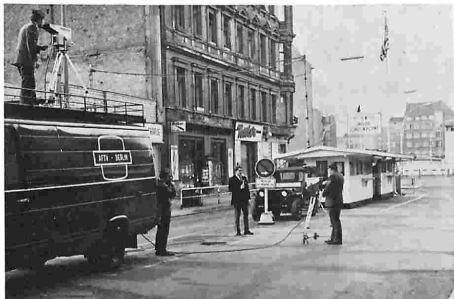
THE MOBILE UNIT, ON LOCATION AT CHECKPOINT CHARLIE, provides the capability of covering special events beyond the studios. The remote control van houses all of the essential and technical controls which make it actually a mobile TV studio.