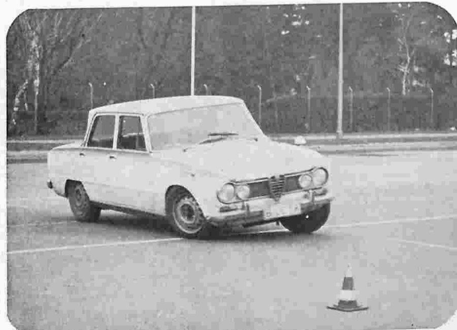
FOR EXCITEMENT IT'S AUTO SPORTS and you can be a part of the fun and excitement by joining the Berlin American Auto Association. Read the adjacent article to find out more details.

BOXING SMOKER CANCELLED The 2/6 Boxing Smoker has been cancelled by AG, as all the boxers were eliminated for medical reasons.