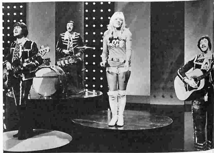
MIDDLE OF THE ROAD . . . to appear in the Sportpalast soon.

But when you come to the Sportpalast to see and hear them live in concert, you will also get to make the acquaintance of a quite original duo from Holland called "Mouth and MacNeal." "Mouth" is Willem Duyn, who started out as a drummer in a band and became a singer by coin-