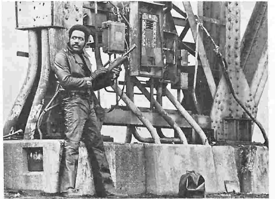
"O.K., LET'S GET THIS STRAIGHT. If the bag moves, blast it?" Richard Roundtree seems to be having a little trouble getting his bag together in SHAFT'S BIG SCORE. The structure next to him appears to have been the object of many a target practice session.

A U.S. Marshall, Richard Crenna, gets handed a raw deal as he is assigned the duty of arresting his old friend, played by Yul Brynner. This is one of those westerns that like to mix a little humor into the story in order to keep you awake wondering what the next outrageous pun is going to be. I wouldn't recommend CATLOW for an Academy Award, but on the other hand I don't really like John Wayne either. It beats sitting in your room staring at the four walls, but just barely.