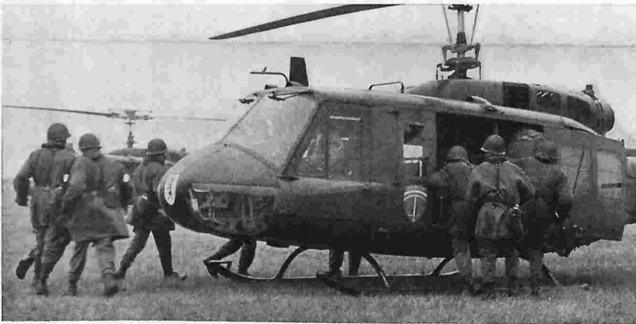
SCURRYING TO THE Aviation Detachment's Huey are members of the Second Company, 46th Infantry Regiment in Tuesday's exercise. It didn't last long as bad weather forced the operation to end prematurely.

Next week is Black History and Brotherhood Week. The Observer has attempted to bring you some facts over the last several months to improve your knowledge of ethnic history. For this special week, we bring you a multiple-guess test of your knowledge on page 2.