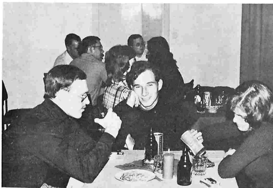
KONTAKT MEANS FRIENDLY COMPANY and new acquaintances, as this American soldier shows at a recent Project KONTAKT mixer.