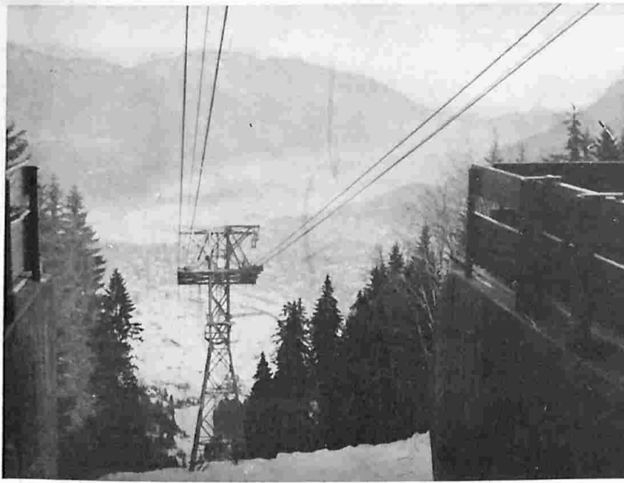
IT'S A LONG WAY DOWN and it took some hard and careful skiing to arrive safely at the bottom. Skiers from CBC-2/6's Radar/Redeye Platoon skied here on the Zugspitze last month and concluded their Operation Eagle in the Harz Mountains this month.