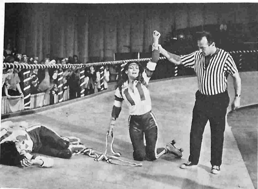
"AND THE WINNER IS" Raquel Welch in another exciting roller derby session down at the Forum. Now you can see in color in The Kansas City Bomber what you see in black and white on AFTV-Berlin.