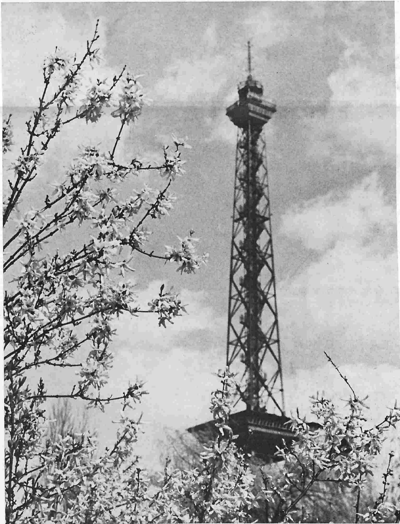
SPRING IN BERLIN has finally arrived and we hope it stays a while. Flowers are just starting to bud and will soon look like these in the vicinity of the Funkturm.