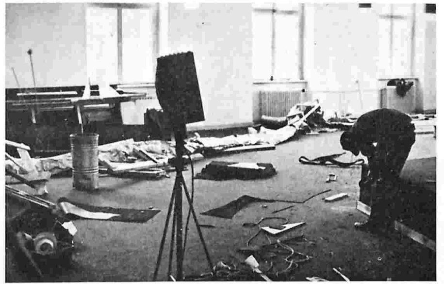
THE TOP FLOOR Music Center at Andrews Barracks, as it was during the recently completed remodeling. "Operation Sound" will be presented there Dec. 19.

No reservations are necessary. Just pick up a toy, and come up to the Top Floor, Building 906, Andrews Barracks, right above the Hi-Lite Service Club. That's Wednesday, Dec. 19, at 7:30, at the Top Floor. Spend a toy . . . Share Christmas with a child.