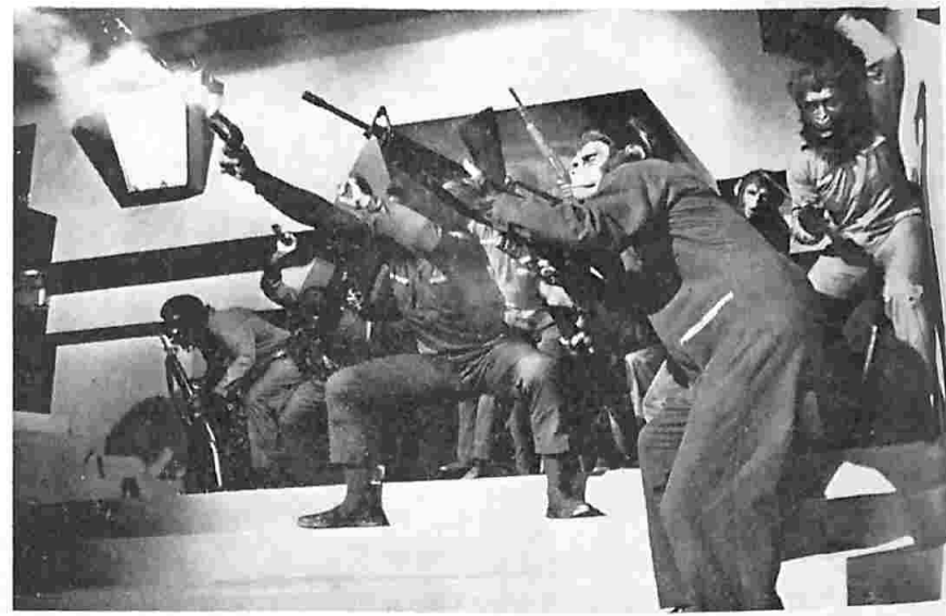
"But sir, I already qualified on the M16 last April!" Caesar (Roddy McDowall), foreground, reluctantly takes aim in the indoor firing range in Conquest of the Planet of the Apes.