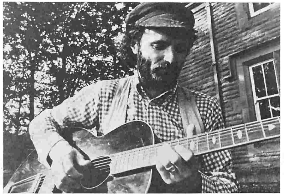
MICHAEL CHAPMAN... strums his guitar with folksongs and ballads at Urania Haus Sunday.

If you would like to begin this weekend with lovely cembalo music, go to the Hochschule für Musik tonight. Beginning at 8 p.m., Zuzana Ruzickova from Prague will hold a cembalo recital. Selections by Frescobaldi, Couperin, and J. S. Bach will make up the program. Tickets are available at the box office of the Hochschule.