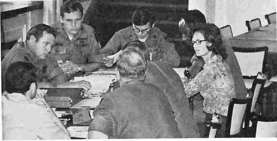
PARTICIPANTS IN A RECENT alcohol abuse seminar in Berlin ponder new approaches to the problem. The Army has found that strict disciplinary action against alcohol abusers is not an adequate solution to the problem.

You will also hear of efforts to clear up some of the myths involved with alcoholism—you aren't an alcoholic because you lack the will-power to stop drinking. Will-power doesn't keep you from being an alcoholic any more than it will prevent the measles.