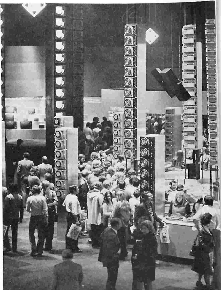
THE 1973 INTERNATIONAL Radio and TV Exhibition continues to draw large crowds at the Funkturm exhibition halls. It closes Sunday.

Greek pop singer And then there is a Greek pop singer in the Philharmonie this Wednesday, Sept. 12. His name is Demis Roussos, he lives in Paris, was born in Egypt and his best-selling single was "Goodbye, My Love, Goodbye." Since I've not had the pleasure of hearing the gentlemen yet, I can't really tell you much about him, other than he mixes the folk themes of his youth with pop rhythm and instruments.