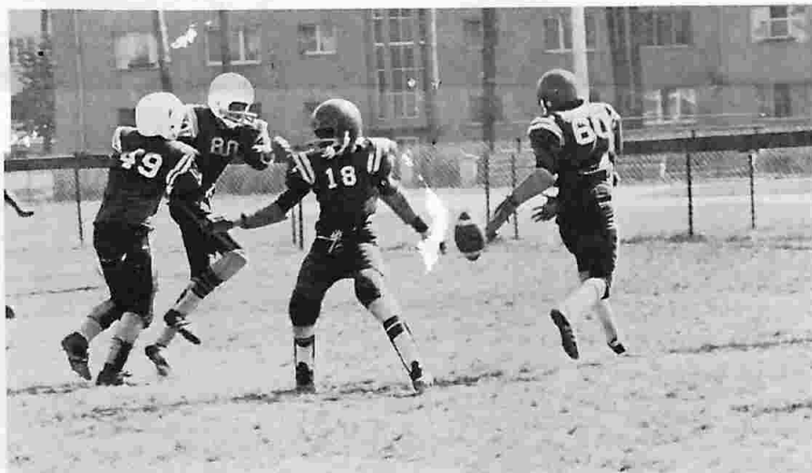
AYA FOOTBALL starts season action this weekend. Here a quarterback passes to a back in a recent scrimmage.