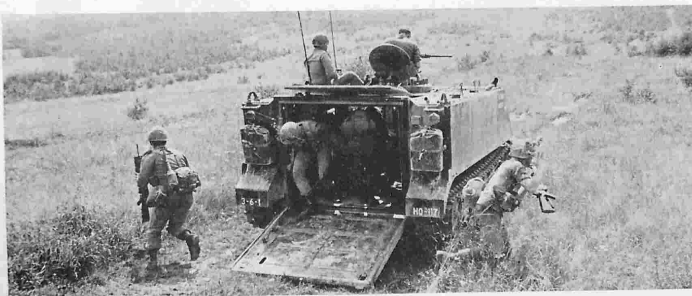
HUSTLE IS THE word as members of Co. B, 3/6 pile out of an APC on the MISPIC course at Grafenwöhr last month.

All of the squad weapons were used, including the grenade launchers and the 90mm recoilless rifle, letting all of the men fire their weapons in situations similar to actual combat.