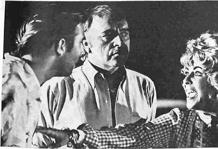
"WHAT DO YOU MEAN, pointing is impolite?" points out the booby prize winner of the 1972 Army Vanderbilt Etiquette Award, Elizabeth Taylor, in Hammersmith Is Out.

Cesar Romero and Chuck "The Rifleman" Connors star in "THE PROUD AND THE DAMNED" , about four young Texans who are mercenary sharpshooters in revolution-prone Latin America.