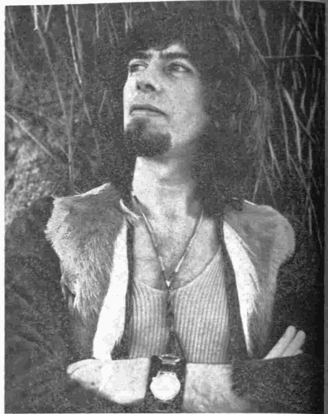
YEA, THAT'S RIGHT. I'M JOHN MAYALL. WHAT ABOUT IT? Only that this "elderly" English crusader for the blues will make an appearance May 5 in the Deutschlandhalle with help from an impressive and famous group of musicians to wow Berliners.

let Leningrad. The Russian guest stars can be seen in "Giselle" and "Concerto" on May 10 and on May 11 again in "Concerto" plus the third act from "Sleeping Beauty" and a pas-de-deux.