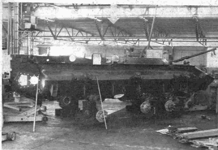
STRIPPED — The tank is torn down to this while its various parts are refurbished.