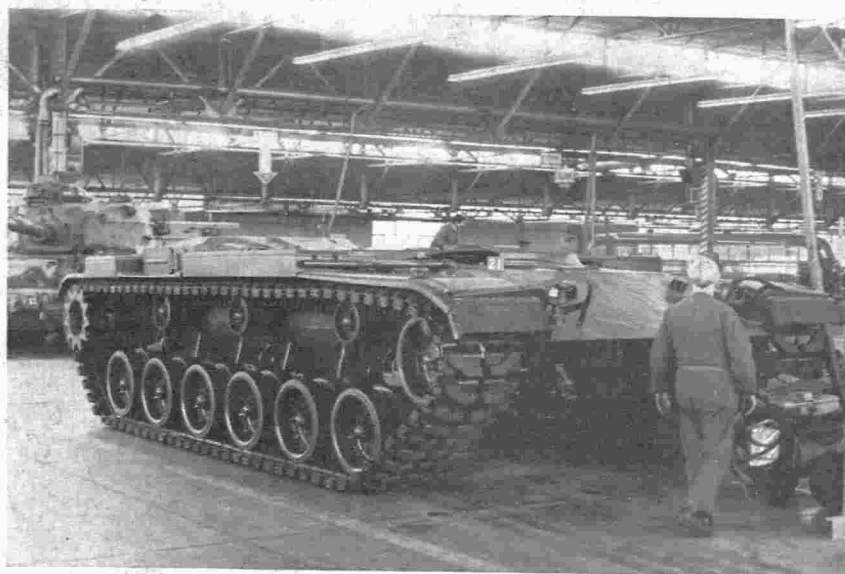
REINCARNATION — The body of the tank is now ready to be married once again to its turret top.