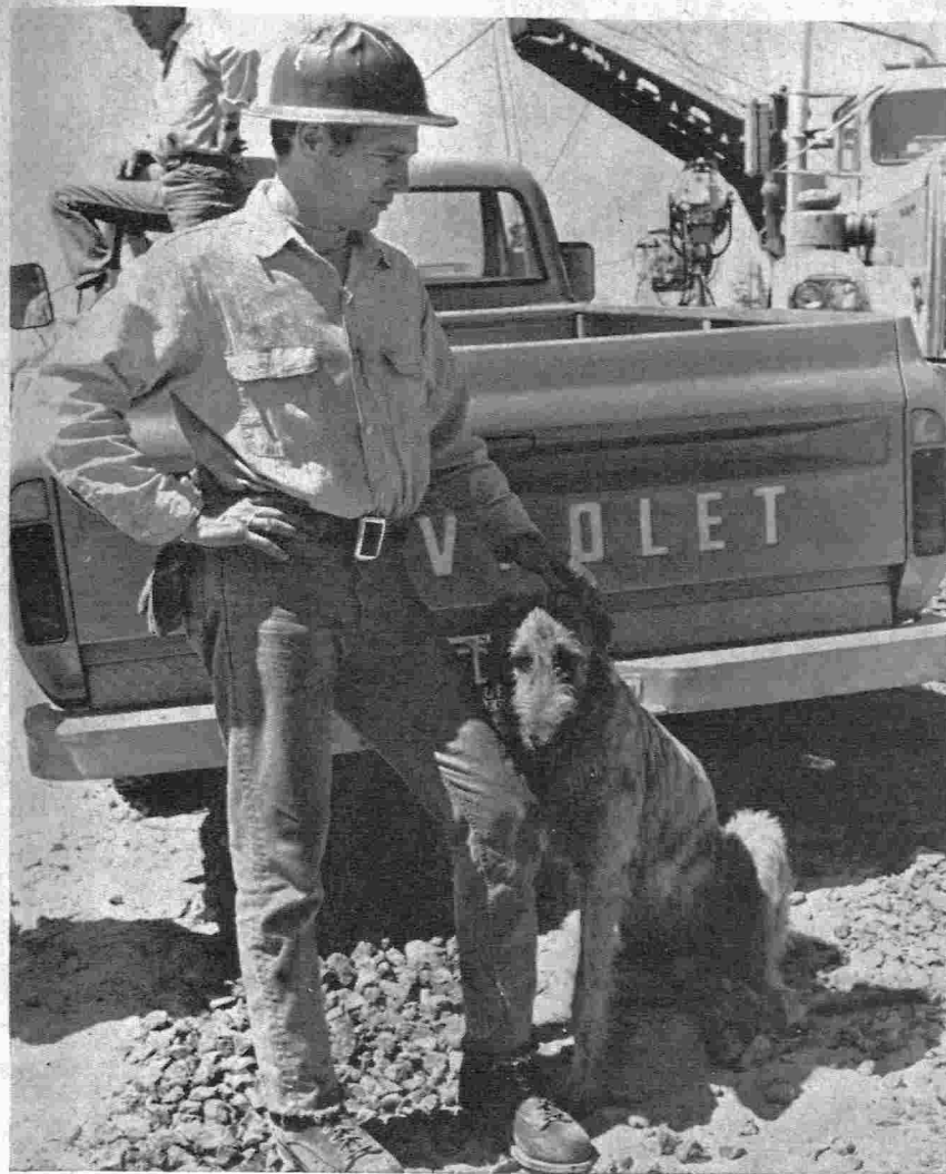
GEE PAUL after some of the babes you've played opposite in flicks this one is a real dog. Actually the way the girl in this flick bounces around Paul Newman might rather have a dog as a friend. That's all irrelevant though as the meat of the story is the drama surrounding a logging operation in Oregon in the movie Sometimes A Great Notion.