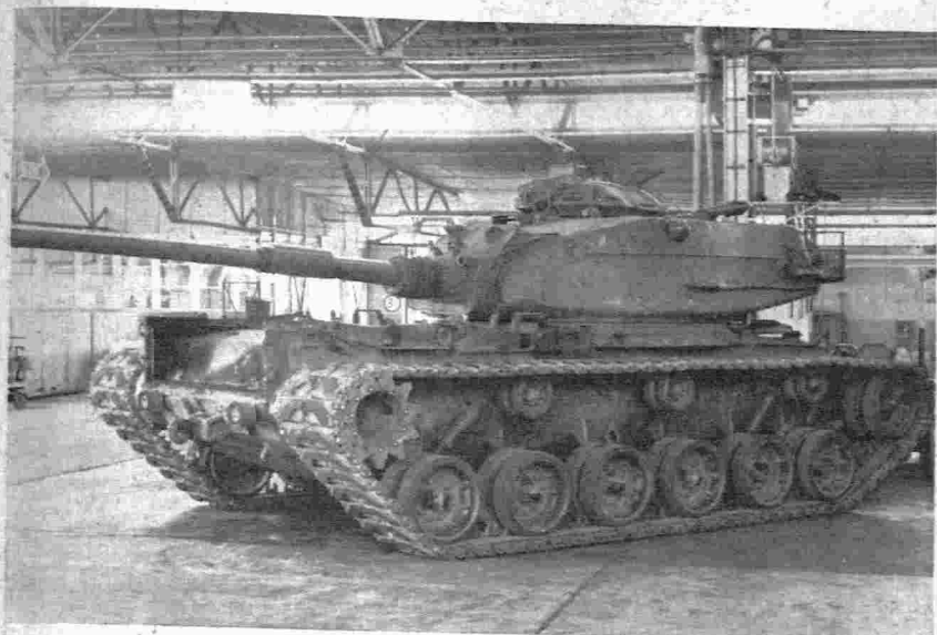
5,500 MILES — This is what the tank looks like after that many miles. It is ready to go through the overhaul.

by Sp4 Dan Eggleston If you bought a new car, how would you like the warranty to read that after 5,500 miles you automatically get a new car? It's not likely that your new car warranty will say that, but when Company F, 40th Armor receives a new tank that's the deal they get. When 5,500 miles rolls on the odometer, that tank rolls over to the Maintenance Division at Andrew Barracks for a complete overhaul.