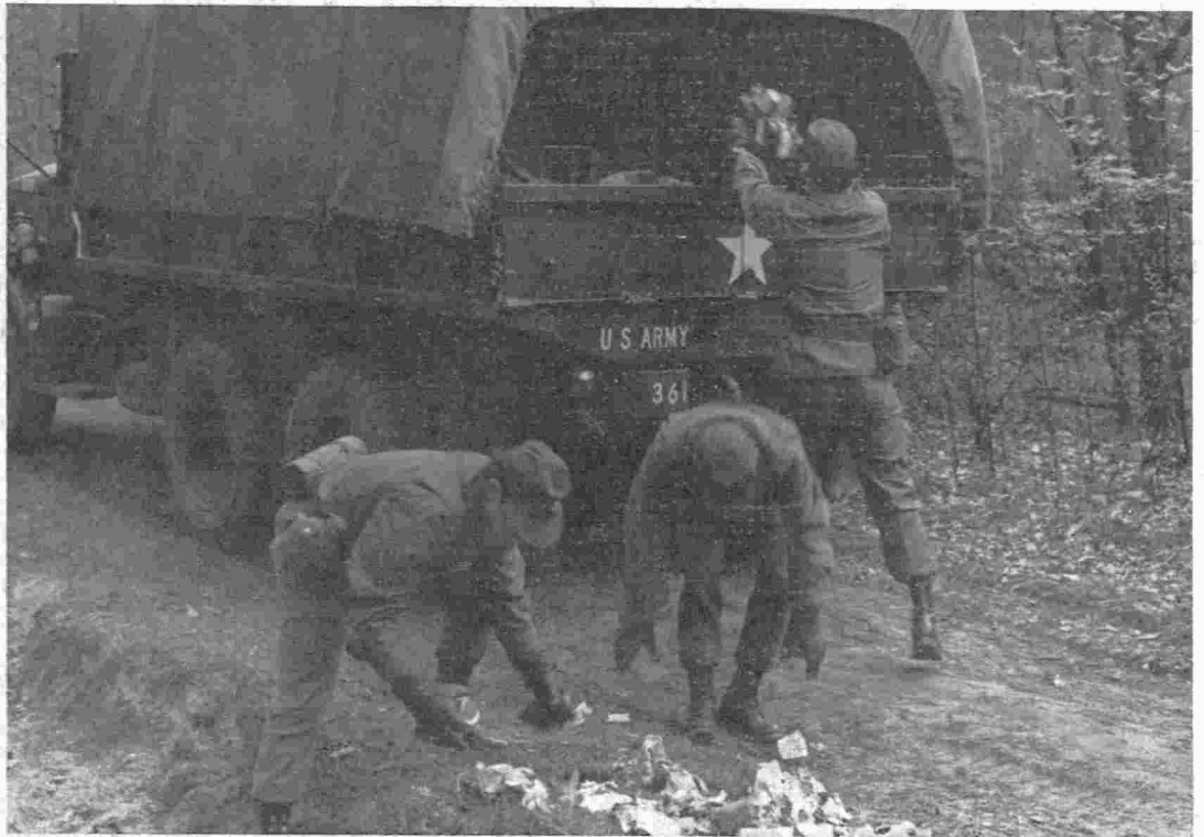
CLEANING-UP — Spring clean-up moved out to the Grunewald this week as members of 3rd Battalion, 6th Infantry did their share in helping to keep Berlin a pretty place. Several truckloads of trash were collected by the Defenders from alongside roads and walkways there during the two days of work. When finished, all agreed that the Grunewald is much more beautiful when it isn't littered with trash.

Fortunately for personnel in Berlin, fair and equal service is available from the many places of entertainment as proven through the efforts of Force Improvement in project "Off Limits". It is now the responsibility of each member within the command to make sure these favorable conditions persist thus allowing the continuation of friendships between the German and American communities.