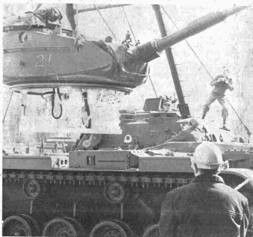
REUNITED — The turret is lowered into the tank and soon the Patton will be rolling along once more.