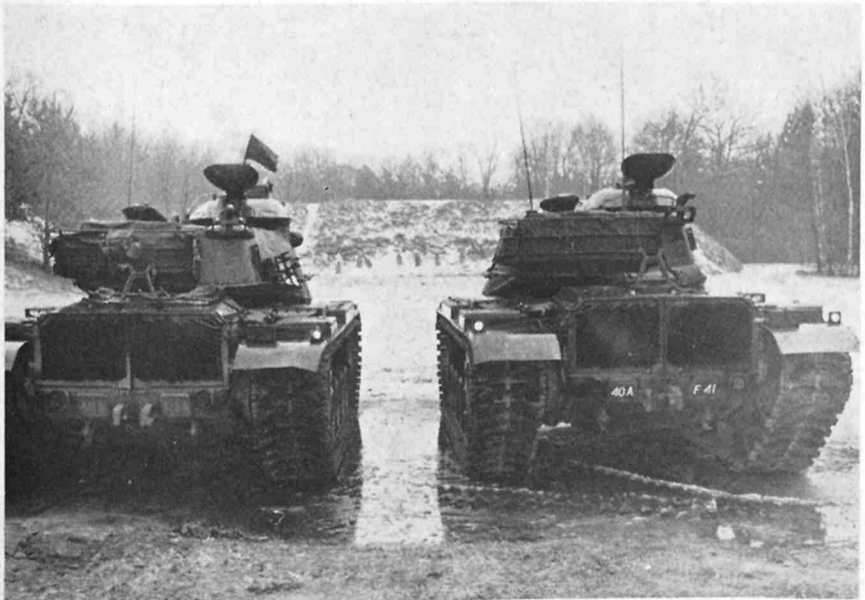
DOWN RANGE. Pointing the business end of two M60 A1 tanks down range, the men of Company F, 40th Armor participated in an exchange last week with tankers from the 11th Chasseurs, French Army, Berlin.