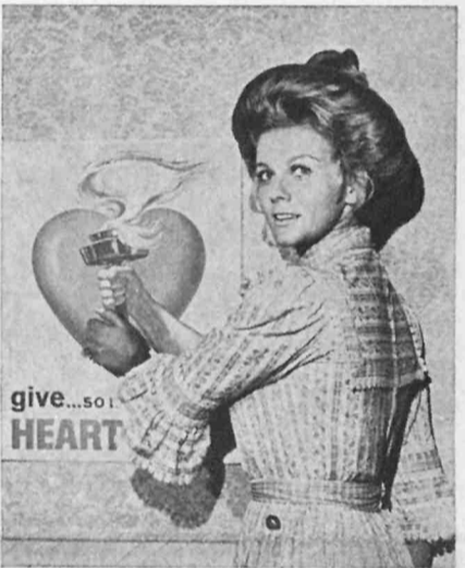
CARRIES TORCH FOR OVERSEAS CAMPAIGN — Film Star Ann-Margret poses with familiar Heart Fund poster to create an optical illusion. Actually, the right arm is a part of the familiar arm-and-torch poster, while the left belongs to her.