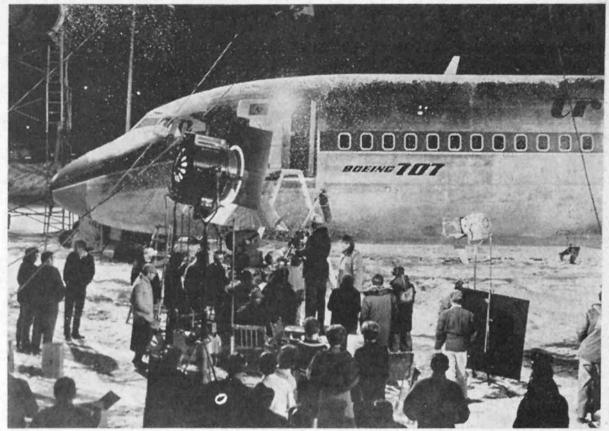
THE WHOLE BATTALION TOOK THE FREEDOM FLIGHT FROM TEGEL? and other scenes of congestion from "Airport," playing at prime tariff on the flick circuit.