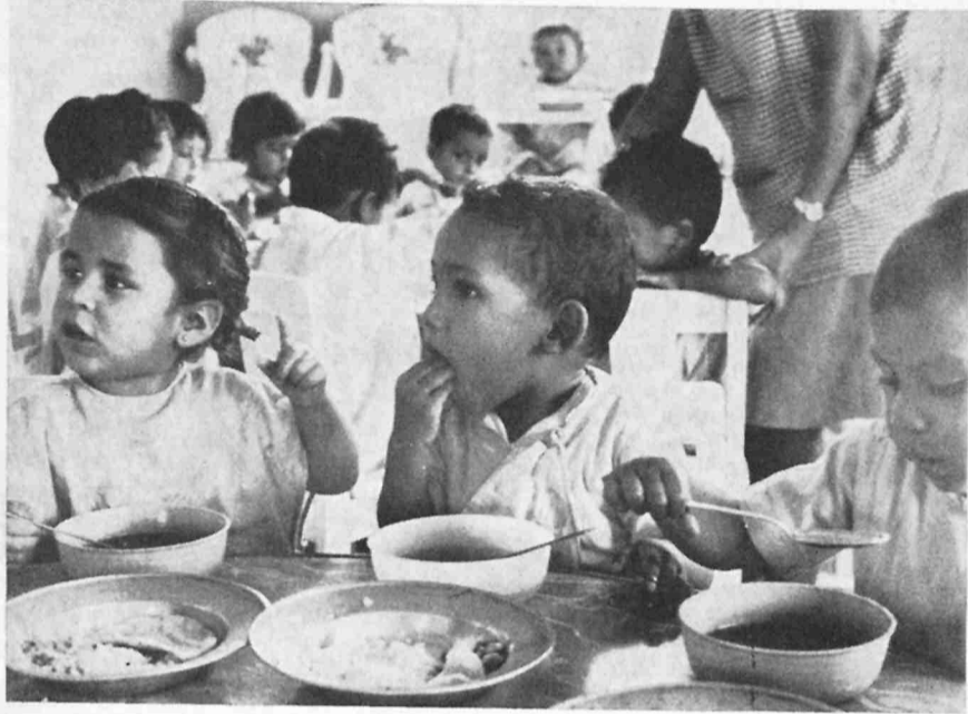
A MEAL A DAY keeps malnutrition away from young children at a pre-school center in Honduras, thanks to the CARE lunches that enrich their diet. CARE participates in the Overseas Combined Federal Campaign.