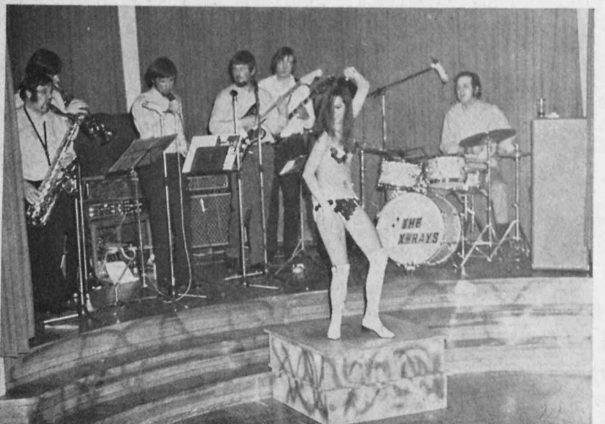
AND AWAY WE GO-GO. A dancer works it out to the beat of the band, all to and for the benefit of the audience at the Harnack House. The up-beat entertainment is only part of the new face of the Officer and Civilian's Open Mess.