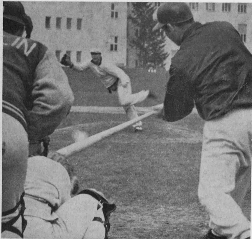
SPRING SWING. Baseball season is just around the corner and the 1970 USAREUR champion Berlin Bears are working out to defend their title. The Bears open the season May 22 with a three-game series at Frankfurt against the 3rd Armored Division.