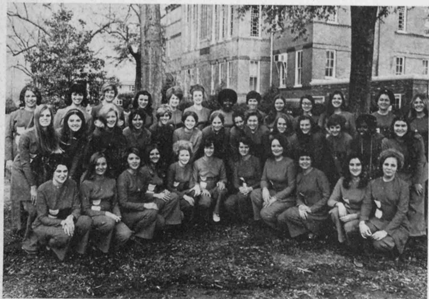
MISSISSIPPI MUSIC-MAKERS — Members of the Mississippi State College for Women Tour Choir will perform Monday, April 12, at the All American Service Club. The performance is one of five MSCW concerts throughout Western Europe.

"In order to change the blighted image of American young people," the Tour Choir of Mississippi State College for Women will present a concert April 12 at the All-American Service Club at 8:00 p.m.