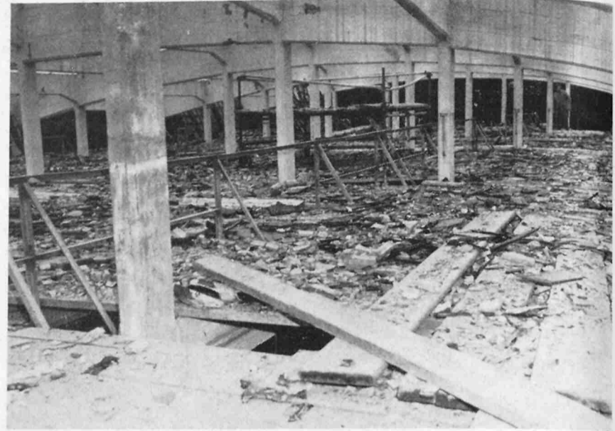
THINGS WILL IMPROVE. This is the present scene of the roof of the Andrews Barracks Swimming Pool, which will soon undergo a rejuvenation process.

The Andrews Barracks pool, located just inside the main gate at Andrews Compound, was conceived