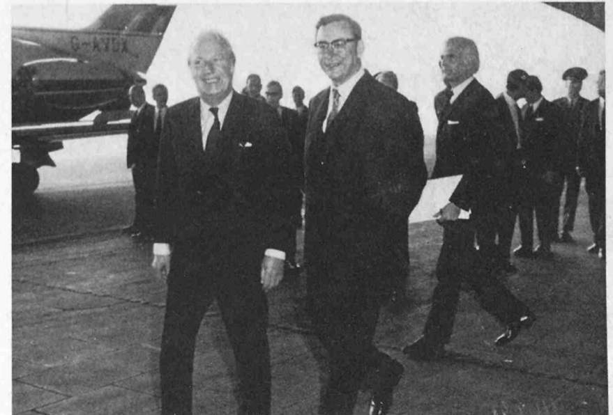
GREAT BRITAIN'S Prime Minister Edward Heath (l.) with Berlin's Governing Mayor Klaus Schuetz, as the British head of state arrived at Tempelhof Central Airport on Sunday for a short visit to the "Divided City." The Prime Minister's visit was part of a three-day trip which included stops in West Germany.