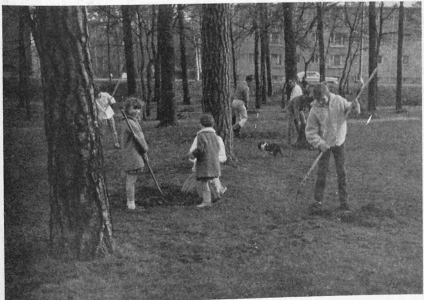
ALL HELPED. Even the kids get into the action during last week's Spring Cleanup throughout the American Community. Remember, area beautification is a year-round job.

The repayment period is five to 10 years, beginning one year after the borrower ceases to be at least a half-time student.